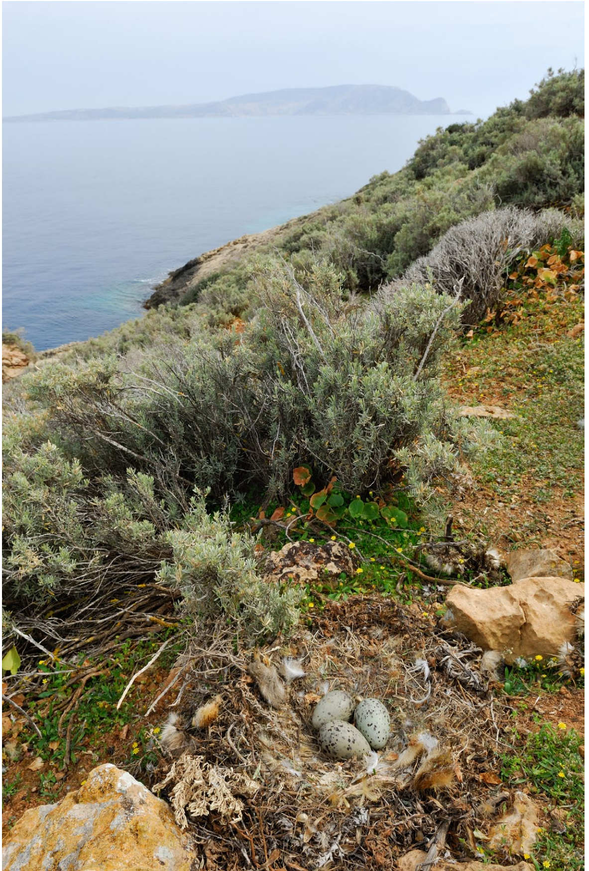
Fig. 3. Halo-nitrophytic scrub with Atriplex mollis on Gavdopoula in its single European locality, with gull's nest ( Larus michahellis michahellis ). – Photo by N. Turland, April 2009.