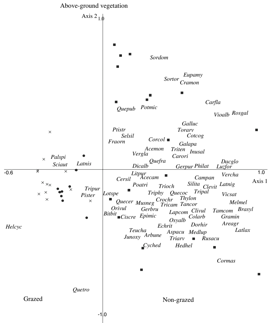
Fig. 2 Ordination (PCA) species-samples diagram (species data set of 42 above-ground vegetation plots) along axes 1 and 2 (eigenvalues for the first two axes 0.249 and 0.107, respectively). The species are labelled by the first three letters of the generic name and the first three letters of the species epitheta (see Table 1 for full names). Plots are displayed as: ● boar-grazed plots; × boar-grazed plots; × ruminant-grazed plots; ■ control (i.e. non-grazed) plots

bank since they rarely produce seeds in shady habitats (Buckley et al. 1997). Another group of species with Clematis vitalba and Lapsana communis were absent from the seed bank of the study area, although they were found in seed banks of woody and disturbed habitats elsewhere (Roovers et al. 2006).